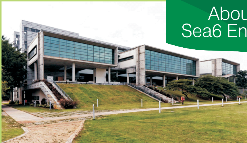
Sea6 Research facilities, Bangalore, India

Sea6 Energy, a biotech company, was founded by the alumni of the prestigious Indian Institute of Technology (IIT), Madras in 2010. It is based in the Centre for Cellular and Molecular Platforms within the University of Agricultural Sciences, Bangalore. Over years Sea6 has build R&D expertise and has demonstrated capability of sustainably harnessing the potential of the oceans to create novel technologies & products in the fields of Food, Feed and Fuel.